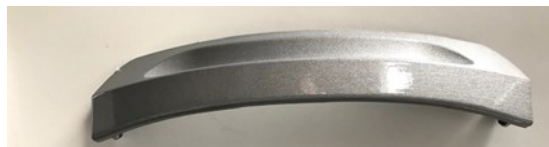
Zeomic® Door Handle

As part of our continuous improvement efforts, Crystal Mountain is making changes to the Storm family of products. In response to requests from the market, the faucet handles and other contact points to have anti-microbial protections built in. We will be building the original Storm units with the faucet handles, door handles and top cover trim which have been impregnated with Zeomic®, a zinc based anti-microbial additive. In addition, the contact points on the pod holder and brew selection user interface for the Storm Café will also use Zeomic® impregnated plastics. This change will affect new production as well as spare parts. Since all production will progress to these parts once inventory is depleted, there will be no change in part number. Photos of the new parts are below.