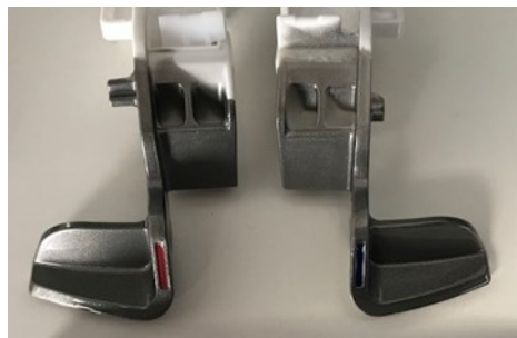
Zeomic® Faucet Handles

In addition, the chrome trim strip detail on the top cover will be replaced with a black component which has been impregnated with Zeomic®. That part number will be PLC-C150144. As with the other changes, this will take effect once the inventory is worked through at the factory.